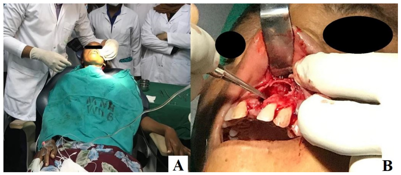
Fig. 1. (A) A woman sedated and planned for a surgical procedure under intravenous-conscious sedation with a group of trainees observing. (B) An intraoperative picture of the patient showing a bony defect on the anterior part of the maxilla following the enucleation of a cystic lesion.