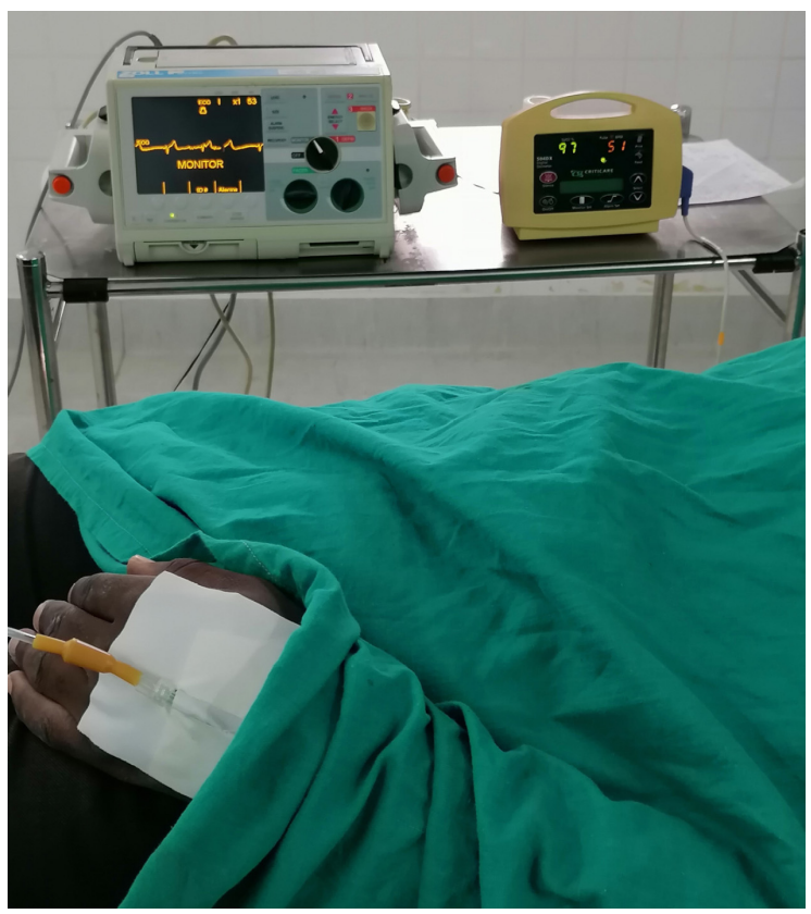
Fig. 2. A man being monitored while being surgically managed under intravenous-conscious sedation.

surgical procedures, and those undergoing conservative dental treatment were excluded. A thorough patient history and examination (clinical and radiological) were conducted, focusing on the general health status,