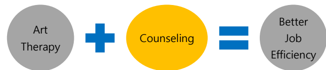
Figure 1: Research Aim of This Study

There is little emphasis on alternative forms of communication in psychotherapy, thus leaving a gap in research on the impact and effects of alternatives such as using artistic expressions. This paper, therefore, seeks to address the gap by investigating the effect of psychological counseling using Art Therapy on improving workers' job efficiency. Essentially, the research aims to describe Art therapy and its impact on improving employees' job efficiency. Art therapy enables a detailed and accurate understanding and analysis of the client's emotions and expressions, thus facilitating correct counseling and mitigating mental health challenges.