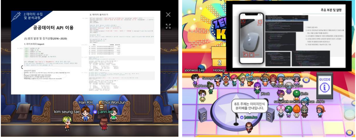
(c) In-class: Carrying out the group project (d) Post-class: Project presentation Figure 2. Example of a class conducted with metaverse learning