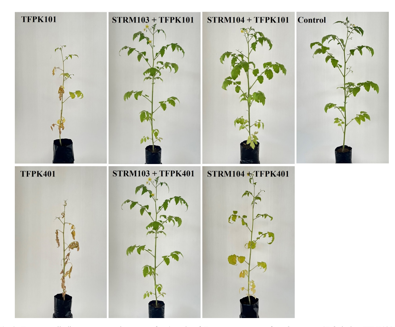
Fig. 2. Fusarium wilt disease symptom in tomato after 4 weeks of Fusarium oxysporum f. sp. lycopersici ( Fol ), isolate TFPK101 and TFPK401 inoculation. Culture filtrate of Streptomyces sp. isolate STRM103 and STRM104 were drenched on the soil near the tomato's root crown 2 days before Fol inoculation and every week after Fol inoculation.