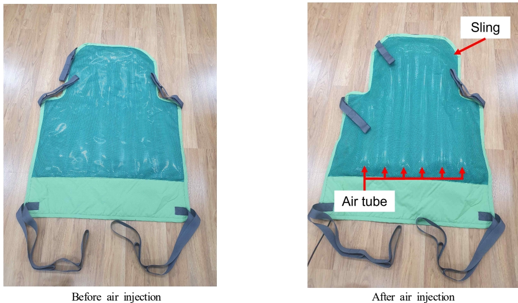
Figure 2. Customized sling lifts

lift the patient from the ground or floor, move to the desired location, and put the patient down.