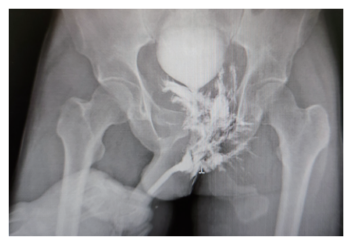
Fig. 2. A case of bedside urethrography in a 36-year-old patient. Dye leaked from the posterior urethra.

In our case, after the surgery, interventional radiologist recommended guidewire Foley insertion to prevent urethral stricture.