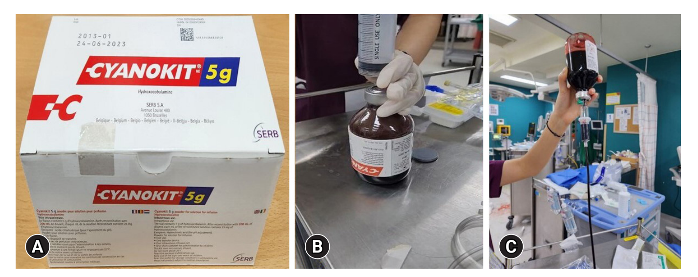
Fig. 4. Images of Cyanokit (Serb Pharmaceuticals). (A) Cyanokit pack, the antidote for cyanide poisoning. (B, C) It is infused after mixing 200 mL of normal saline.

Very high temperature air usually damages the structures above the carina, and chemical injury is usually likely to occur in the lower part [19,20]. Furthermore, airway injury appears after several days rather than immediately following combustion, and overall better outcomes are reported in groups that underwent bronchoscopy; therefore, it is necessary to consider during the hospitalization [21–23].