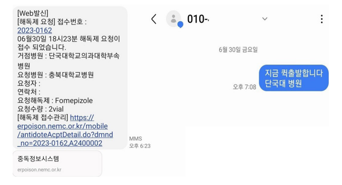
Fig. 5. The text message captured from the author's phone. Fomepizole is an antidote for methanol poisoning and is also an orphan drug. Another hospital physician requested this drug using the antidote request system. After receiving the request text message at 18:23, it took 45 minutes to send the drug to that hospital. Furthermore, it took another 1 hour in estimate for the transport. This orphan drug can be used in other hospitals; however, it takes time.

In Korea, there are several types of specialty hospitals, including regional emergency medical centers, regional trauma centers (level I trauma centers), toxicology centers, burn centers, and hyperbaric chamber centers. When transferring the patient, which among the centers is the most appropriate to visit? This is not easy to answer as determining which damage is the most serious at the prehospital stage is very difficult, and these centers separately exist in Korea. It is necessary to improve the healthcare system. However, along with the improvement of the system, it is essential to raise physicians' awareness of these types of injuries. Cyanokit, an orphan drug, can be sent to another hospital by the parcel service following physicians' request even if it is not a dedicated toxicology center (Fig. 5). The problem is that most physicians are unaware of this process, and certain antidotes should be immediately administered but the time delay is considerable; therefore, it may not be practical or effective. Moreover, if primary physicians are unaware, they may decide on a simple transfer to a burn center without antidotes following initial stabilization