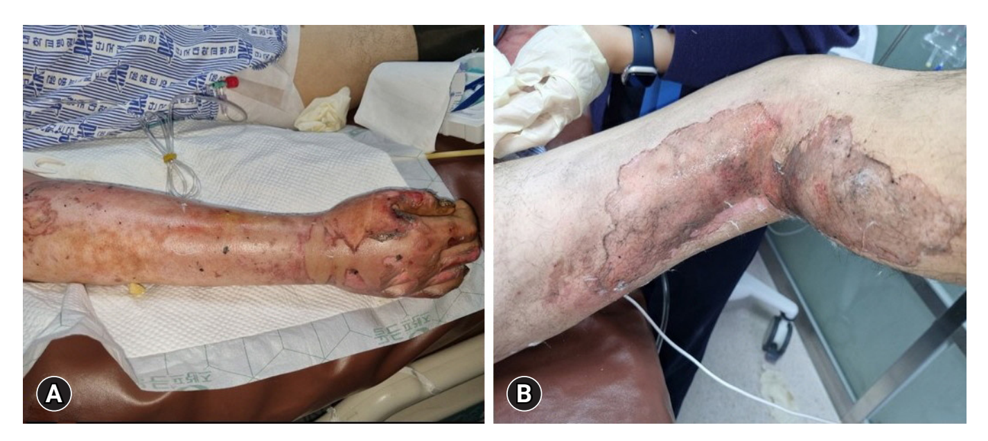
Fig. 1. Second-degree skin burns of the arms and legs. Twenty-five percent of the total body surface area is noted. (A) Right arm. (B) Right leg.

To confirm airway injury due to inhalation burn, following antidote administration, an otolaryngologist performed upper airway bronchoscopy; however, no specific injury findings were observed. However, owing to the possibility of pneumonia or airway obstruction, he was admitted to the intensive care unit (ICU) and prescribed steroids and antibiotics. The next day, he complained of sudden hoarseness of voice and difficulty in breathing,