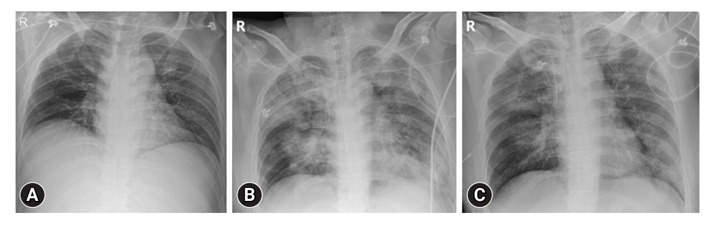
Fig. 2. Chest x-ray images of the patient. (A) Initial chest x-ray. No pathological lesion is observed. (B) Chest x-ray on the 9th hospitalization day. Pneumonia is observed in both lungs. (C) Chest x-ray on the 10th hospitalization day. Improved status of pneumonia.