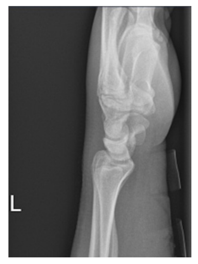
Fig. 7. Demonstrating the radius-lunate-capitate view on a lateral anatomically normal x-ray.

Pediatric lunate fractures are rare, and as a result, little high-level evidence has been published. The evidence found in a literature search is presented in Table 2 [14,17–27]. Current manage-