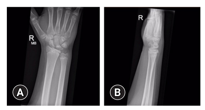
Fig. 1. Wrist x-ray images at presentation. Salter-Harris III fracture of distal radius dorsally displaced, ulnar styloid fracture, and lunate fracture. (A) Anteroposterior view. (B) Lateral view.

A 12-year-old boy presented following a fall onto his dominant hand from his bicycle with a closed right wrist injury (Figs. 1, 2). Radiographs demonstrated a dorsally displaced Salter-Harris type III fracture of the distal radius associated with a displaced lunate (equivalent to type IV in the Teisen classification) and ulnar styloid fracture. The patient complained of reduced sensation and "tingling" in the median nerve territory; however, the motor power remained Medical Research Council grade 5 in all muscle