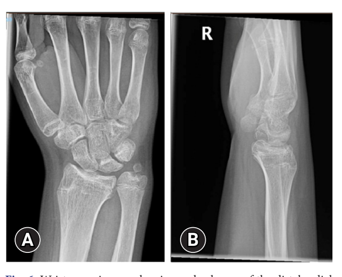
Fig. 6. Wrist x-ray images showing early closure of the distal radial growth plate and consequent ulnar variance. (A) Anteroposterior view. (B) Lateral view.