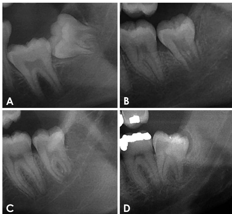
Fig. 3. Cropped panoramic radiographs display examples of impacted third molars at various Nolla stages. A: In stage 7, one-third of root formation is complete. B: In stage 8, two-thirds of root formation is complete. C: In Stage 9, the root formation is nearly complete, with the apex remaining open. D: In stage 10, root formation is complete.