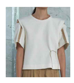
Figure 8. Slit Shoulder Top (www.kolonmall.com)

Stacking means placing many objects from bottom to top and it forms a complex space (Kim, 2017). This is a short-sleeved t-shirt with patchwork of the sleeve lining of a suit jacket over the front of the t-shirt (Figure 11). Figure 12 is a V-neck woven top created by deconstructing a men's white stock shirt and layering it asymmetrically on only one side of the top of the shirt. Flared fabrics are on top of the reconstructed skirt which was deconstructed from men's trousers (Figure 13). Stacking forms a complex space through duplication and overlapping. There is a big difference in the results of stacking depending on the surface structure and volume of the material, so it is important to select a material that suits the purpose of the design.