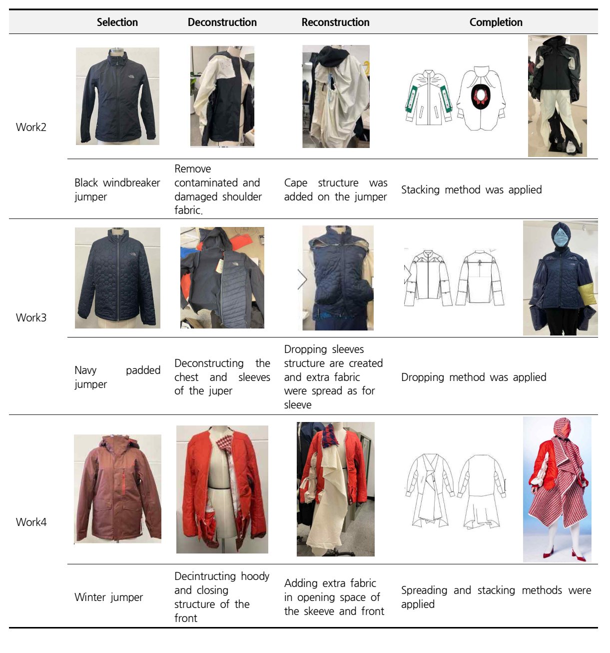
Table 2. Continued