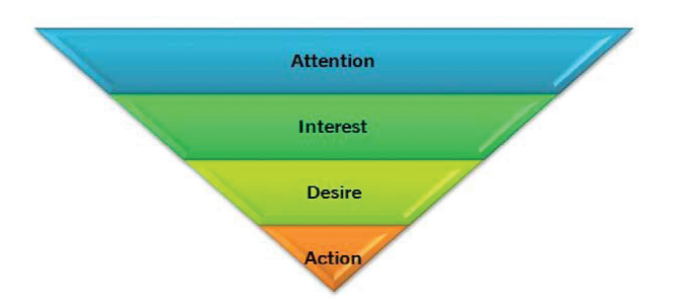
Figure 3: AIDA Model

a. Attention: The prospect's attention must be drawn before they make a buying decision. This decision can be built based on color, typography, sound, image, or the use of advertising stars (celebrities). Text can be used as well, and a good Slogan successfully attracts the attention of potential customers.