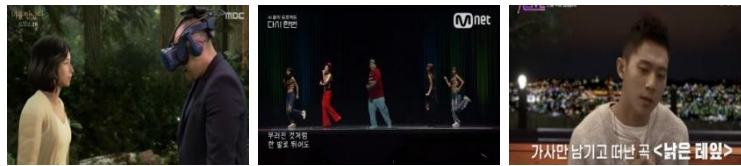
Figure 5. I Met You, Once Again, Alive