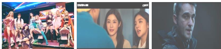
Figure 2. aespa, Hello Share, Blue Dot

The convergence of digital humans and media is not just blurring the lines between the digital and physical worlds, it is also advancing new content creation techniques and viewer experiences. These developments are expected to further expand the media and entertainment sector in the future.