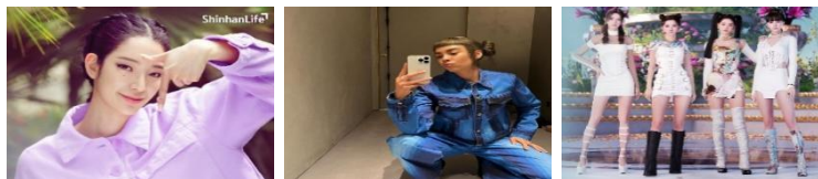
Figure 1. Shinhan Life CF ROZY, Lil Miquela, MAVE:

The development of digital humans is spurring more research and innovation in future computer graphics and artificial intelligence technologies, further blurring the lines between the digital and physical worlds.