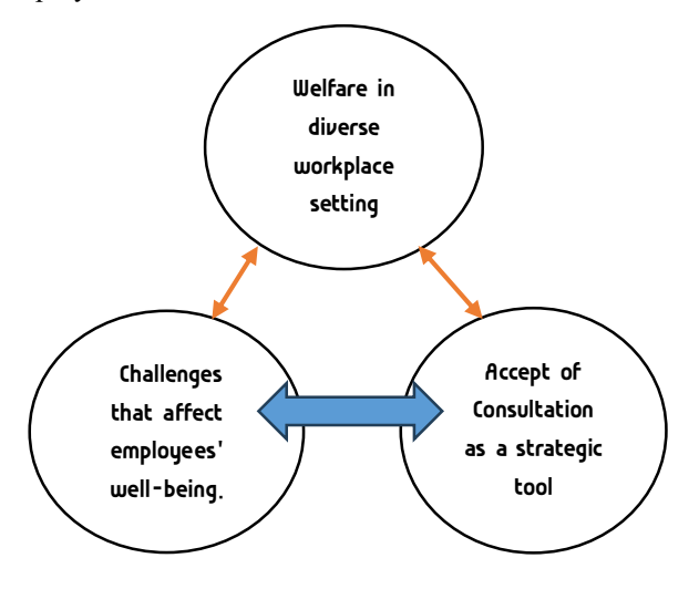
Figure 1: Three Identification for the Research Aim

challenges that affect employees' overall well-being. (3) To examine and establish the importance of consultation as a strategic tool in addressing these challenges and enhancing employee welfare.