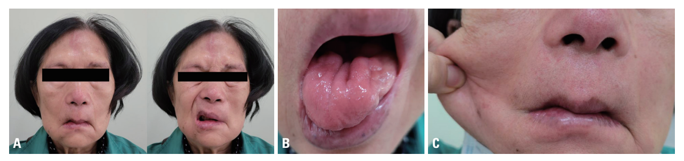
Fig. 2. Photograph of the patient showing marked facial diplegia (A), an atrophic and furrowed tongue (B), and lax skin (cutis laxa) on the cheek (C).