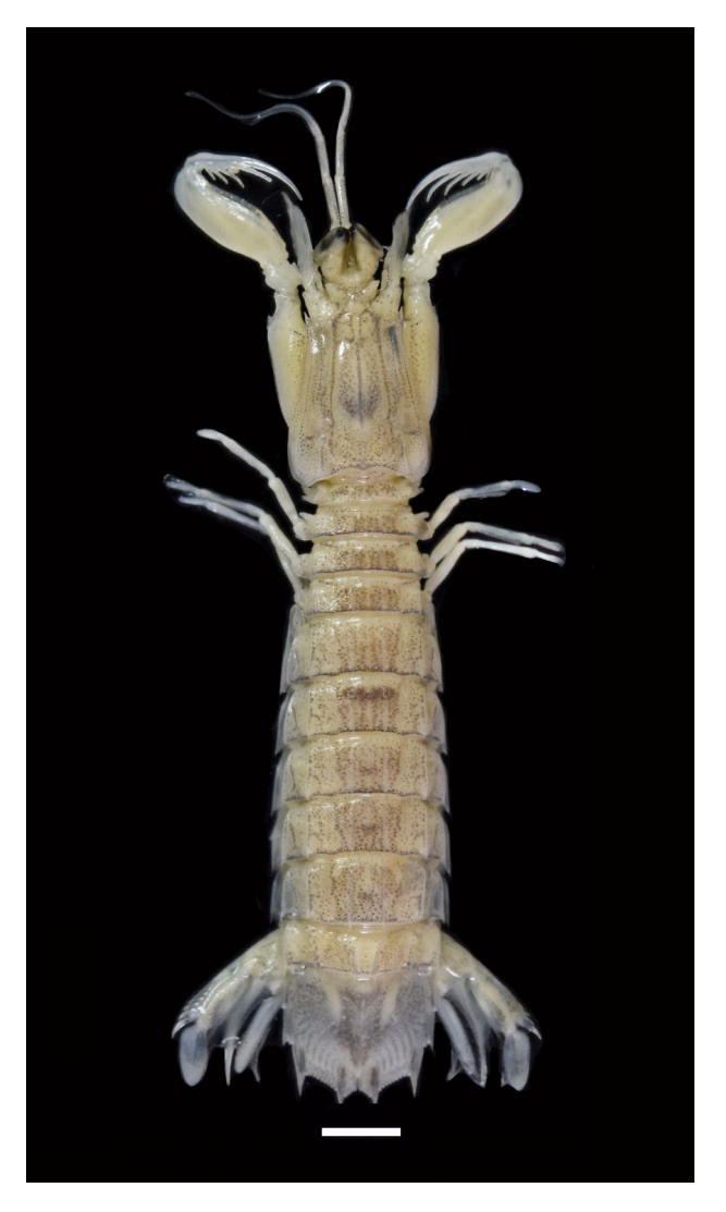
Fig. 1. Oratosquilla fabricii (Holthuis, 1941), female. Whole animal, 52 mm. Scale bar=5 mm.

Distribution. Hawaii, French Polynesia, Fiji, New Caledonia, Indonesia, Guam, Philippines, Taiwan, and Korea (the