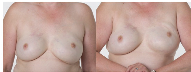
Fig. 4 Patient with mild BAD following prepectoral direct-to-implant breast reconstruction. BAD, breast animation deformity.

Follow-up was comparable between groups. Besides our small population another limitation of this RCT might be the follow-up time. Patients were seen 12 months after surgery, but we do not know if BAD changes over time. It might be worsened in the subpectoral reconstructed group 5 years after surgery. We must also keep in mind that even though the incidence and degree of BAD seems minimized using the prepectoral plane, disadvantages, such as rippling, bottoming out, visible implant edges, and possible ptosis over time,