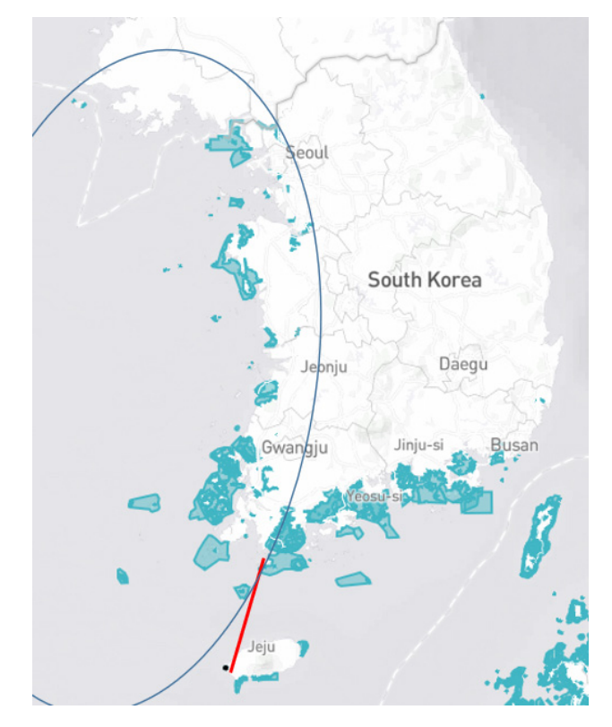
Fig. 3. Map showing the marine protected areas (MPAs) on the Korean side within the YSLME (within the part of circle on the left part of the red line). It also shows the rest of the MPAs and some of Japan's MPAs. The map was extracted from https://mpatlas.org/

Habitat connectivity is an important concept for setting up MPAs, yet it has scarcely been included in management plans for MPAs. Habitat connectivity is important for ensuring that populations are connected through movement and thus maintain connectivity between each other (Gillanders et al. 2003). Habitat connectivity increases the productivity of fisheries. Studies show a link between fish catch and coastal habitat characteristics (including structural connectivity). Therefore, the regions with high connectivity are of high priority when establishing a network of declared fish habitats (Meynecke et al. 2007).