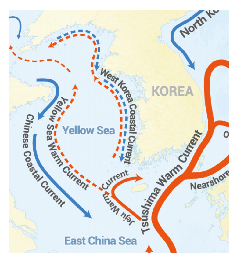
Fig. 1. Major currents around the Korean peninsula. The red line indicates warm water currents, and the blue lines indicate cold water currents

lower than in the South Sea (Fig. 2b). The Korean side of the YSLME can be characterized by limited changes of water temperature and salinity, and the physical properties are largely punctuated by regions influenced by large river discharges (Fig. 2c). Light penetration in the surface waters can thus be largely influenced by the sediment loads adjacent to rivers on the west coast (Fig. 2c).