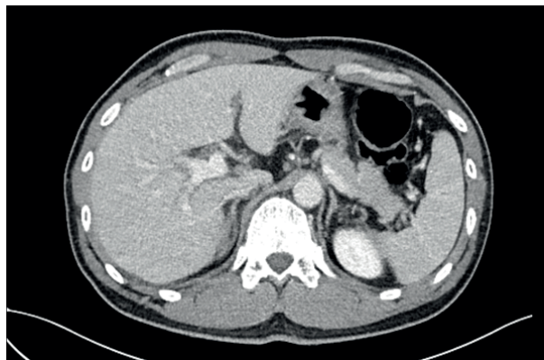
Fig. 1. Abdominal computed tomography shows acute hepatitis with mild hepatosplenomegaly.

One week later, on February 4th, the patient visited the hospital for follow-up treatment. The jaundice improved and there were no other symptoms. In addition, the liver enzyme values showed a tendency to decrease (AST 662 IU/L, ALT 482 IU/L, TB 5.5 mg/dL, DB 2.7 mg/dL).