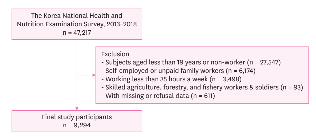
Fig. 1. Schematic diagram of the study participants.

who worked less than 35 hours a week (n = 3,498). Skilled agriculture, forestry, and fishery workers; soldiers (n = 93); and individuals who had missing data or declined to respond (n = 611) were also excluded. A total of 9,294 participants were included in this study ( Fig. 1 ).