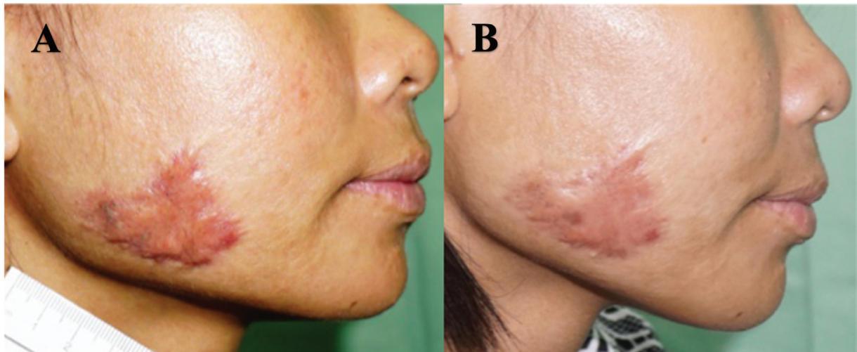
Fig. 2 Improvement in a hypertrophic scar after extracorporeal shock wave therapy (ESWT). The hypertrophic scar at the right jawline; note the redness, vascularity, and thickness before treatment (A). Improvement in redness, vascularity, and thickness of the hypertrophic scar 4 weeks after the completion of ESWT (B).

has not yet been established. Furthermore, current treatments have adverse events associated with their use. 2,3