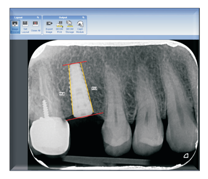
Fig. 2. Measurement of the bone crest to the apex of the fixture at both mesial and distal aspects. Three-month radiographic image. Naser Sargolzaie et al: Marginal bone loss around crestal or subcrestal dental implants: prospective clinical study. J Korean Assoc Oral Maxillofac Surg 2022

Second-stage patient radiographs were entered into the Romexis software. In order to rectify the possible radiographic angle changes based on a constant parameter (fixture), similar to the previous step, the lines at the coronal and apical parts of the fixture were drawn and the recorded numbers in the previous step were entered with the calibration tool. The