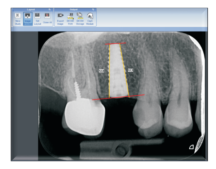
Fig. 1. Measurement of the bone crest to the apex of the fixture in both mesial and distal aspects. Baseline radiographic image. Naser Sargolzaie et al: Marginal bone loss around crestal or subcrestal dental implants: prospective clinical study. J Korean Assoc Oral Maxillofac Surg 2022

Mesial and distal bone heights relative to the fixture apex were evaluated in the three prepared radiographs. Likewise, bone level changes and marginal bone loss values were compared. Bone height was defined as a vertical distance from the crestal bone to the fixture apex. Marginal bone loss was defined as the distance from the implant platform to the