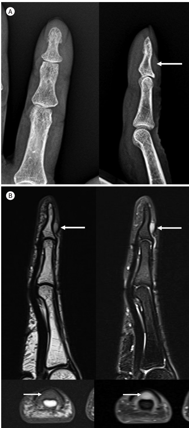
Fig. 1. A subungual mixed tumor in a 65-year-old female.

A. On anteroposterior and lateral radiographs of the left index finger, scalloping (arrow) is observed on the dorsal side of the left index finger. No periosteal reaction, cortical destruction, and tumor matrix ossification are observed.