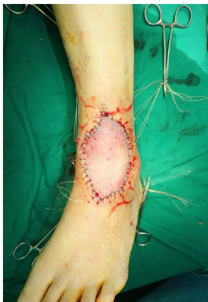
Fig. 3. Intraoperative photograph of dorsal view. A split-thickness skin graft was performed 1 week after the tendon turnover technique.

was observed in the graft site where the tendon had been exposed on postoperative day 7. Conservative treatment was maintained for 1 month, after which the defect site was completely restored (Fig. 4). Compared with the preoperative movements, similar motion of the ankle was observed, but no change was observed in the extension of the toes. After complete wound healing, a silicone sheet was applied to prevent the occurrence of hypertrophic scars, and rehabilitation exercises