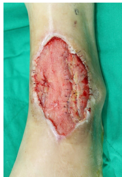
Fig. 2. Intraoperative photograph of dorsal view. The tendons were turned over so that the posterior surface could behave as the anterior side and fixed together to the surrounding granulation tissue or dense remnant fascia using 5-0 Vicryl sutures.