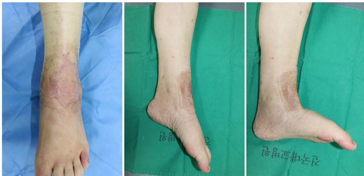
Fig. 4. The skin defect was completely reconstructed 1 month after surgery. The motion of the ankle was similar to its preoperative range. (A) Dorsal view. (B) Plantar flexion was possible. (C) Dorsiflexion was possible.

The vascular supply of tendons has three main components. The first is the musculotendinous junction, the second is the os-