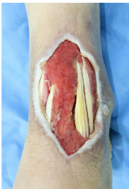
Fig. 1. Preoperative photograph of dorsal view. An 8 × 8 cm full-layer skin defect was observed with exposed tendons in a 48-year-old male patient with diabetes mellitus. From the left, the extensor hallucis longus, the tibialis anterior tendon, and the extensor digitorum longus tendons were exposed.

The skin graft site was observed to be stable 3 days after the skin graft operation. This was followed by simple dressing changes using foam material daily. A small disruption (1 × 2 cm)