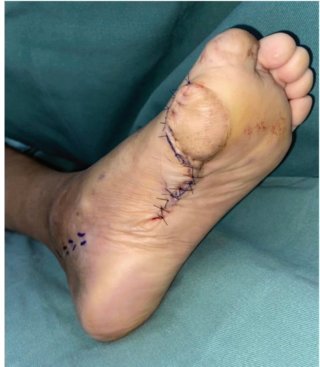
Fig. 2 Wound following incorporation, pedicle division, and flap revision.

To decrease operative time and minimize the number of incisions and risk of wound healing complications, we suggest the use of the "hanging" free flap for the reconstruction of chronic lower extremity diabetic ulcers. Following patient optimization and adequate wound debridement, our reconstruction involves standard free flap harvest, end-to-end microsurgical anastomosis, and inset. Following flap inset, we cover the "hanging" pedicle with a skin graft instead of making extraneous incisions within the undisturbed soft tissues or tunnels that can compress the vessels (→ Fig. 1 and → Video 1 ). While the flap incorporates, the exposed pedicle is protected with a soft dressing. After incorpo-