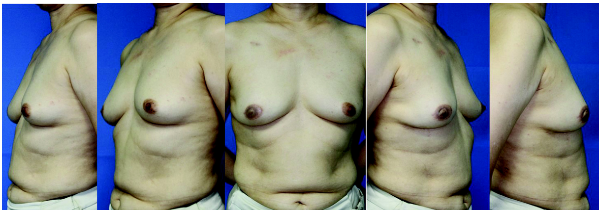
Fig. 1 Postoperative follow-up photograph taken 2 years after breast reconstruction: the LD musculocutaneous flap with implant (Bellagel round smooth type; low projection; 200 mL) after skin-sparing mastectomy with nipple-areolar complex (NAC) excision on right breast.

Through chart review, demographic and clinical information was collected on the patient's age, hospitalization period, postoperative follow-up period, and postoperative radiotherapy. Operative information, such as mastectomy specimen weight, implant size, operation time, postoperative complications, and cost of surgery, was also collected. Only major complications requiring reoperation such as grade 3 or 4 capsular contracture, implant rupture, and skin necrosis were included. A case in which reoperation was performed due to patient dissatisfaction with the size and shape, except for the above-mentioned complications, was considered a secondary aesthetic procedure. Among the BREAST-Q 2.0 postoperative module, the converted scores were compared between the group with DTI and the group with LD flap for satisfaction with breast, psychosocial well-being, and sexual well-being items. In addition, five postoperative photos were taken at the time the breast-Q was given, and the medical staff consisting of three plastic surgeons, one surgeon, and one nurse scored from worst (1 point) to best (10 points) for each item using the aesthetic item scale (volume, shape, symmetry, scar, and nipple-areolar complex), and the total score was calculated and compared (→ Fig 3).