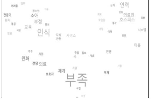
Figure 2. Nurses' perceived needs and barriers regarding pediatric palliative care (PPC): word cloud visualization of the results of an open-ended question.