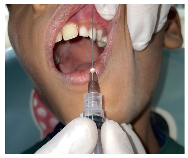
Fig. 1. Figure showing administration of local anesthesia using conventional syringe

Group B (insulin syringe group, 31 gauge), the respective syringes were preloaded with local anesthetic solution. A topical anesthetic was applied at the site of delivery. The child was told that the tooth will be "going to sleep" after administration of magic water. A preloaded syringe was used to deliver the local anesthetic at the site of delivery (Fig. 1 and 2).