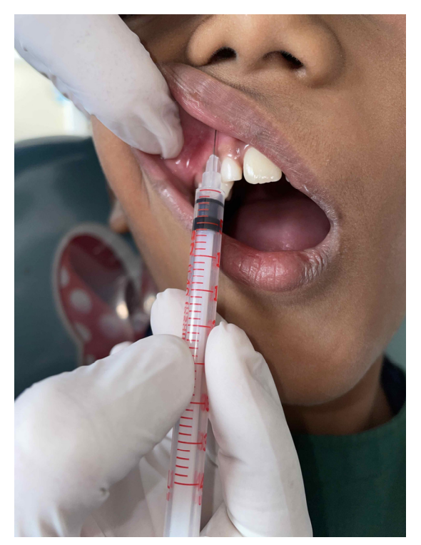
Fig. 2. Figure showing administration of local anesthesia using insulin syringe

Anxiety levels were recorded after the procedure using a pulse oximeter and Venham's Picture Scale. The patient was then asked to record pain perception using the Wong Baker Faces Pain Rating Scale, in which the faces ranged from a smiling to a sad, crying face. A numerical rating was assigned to each face (from 0, "no hurt" to 10, "hurts worst") of the Wong Baker Faces Pain Rating Scale [6].