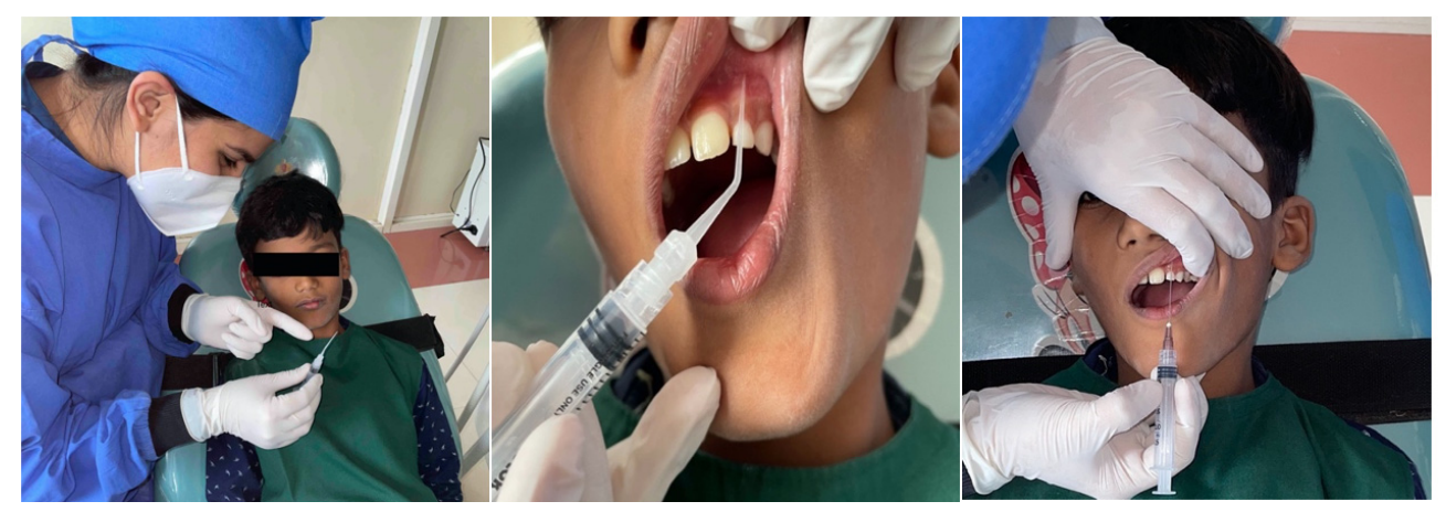
Fig. 3. Figure showing administration of local anesthesia using deception syringe