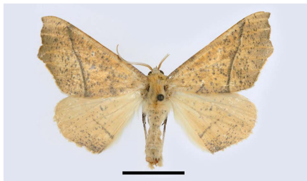
Fig. 1. Odontopera aurata in Korea. Scale bar=10 mm.

Material examined. 1 male, Korea: JN: Yeosu, Is. Geomun-do, 34°2'17"N, 127°17'17"E, 28 Sep 2017, Sei-Woong Choi leg. (NIBR specimen no. 120000503075).