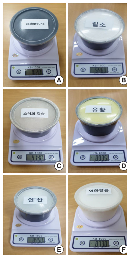
Fig. 2. Chemical fertilizers in scintillator. An empty container as a background (A), nitrogen (B), calcium (C), sulfur (D), phosphate acid (E), and potassium chloride (F) fertilizers are shown.

Each container was weighed on a scale. This time, the container weight was not considered. The net weight was marked on each container and numbered. The distilled water and each specimen were placed on a thallium-activated sodium iodide, NaI(Tl), scintillator-based gamma-ray spectroscopy