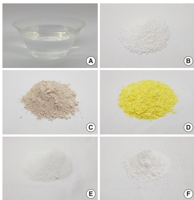
Fig. 1. Distilled water (A), nitrogen (B), calcium (C), sulfur (D), phosphate acid (E), and potassium chloride (F) samples used in this study.

Five specimens (nitrogen fertilizer, calcium fertilizer, sulfur fertilizer, phosphate acid fertilizer, and potassium chloride fertilizer) and distilled water as control were used (Table 1). Each of these five specimens was pulverized and placed in a 500 mL of Marinelli vessel (Fig. 2). The density of the distilled