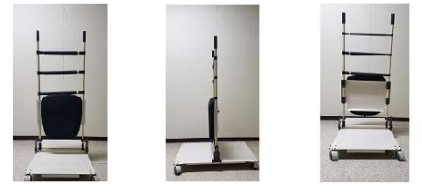
Figure 2. Sit-to-stand transfer assistive device

The movable part has four wheels so that it can be moved after standing up, and the support stand has a structure of two columns so that the user can hold it with his or her arms when standing up. The connective part is adapted to fix the support stand with the movable part or to change the angle of the support stand. (Figure 2).