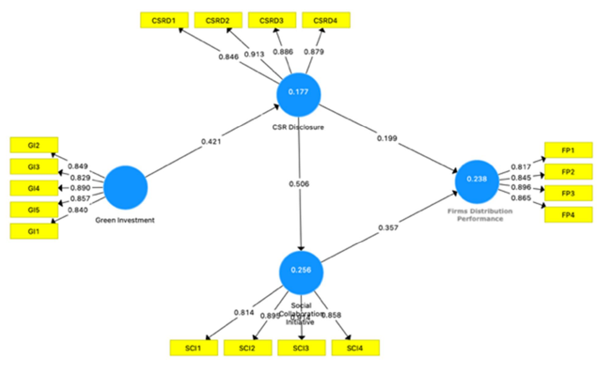
Figure 3: Structural Bootstrapping