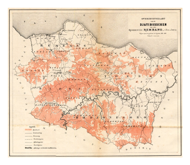
Fig. 1. 'Overzichtskaart van de Djatibosschen in de Residentie Rembang, Java' (Map of the Djati (teak) Forests in the Rembang area, Java).

This study was designed with a historical method which covers four steps. Beginning from the heuristic stage, which is to trace and gather contemporary historical sources either