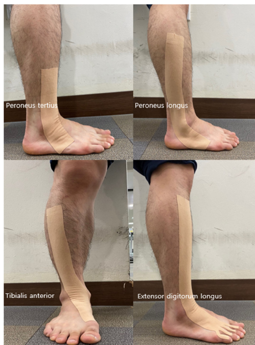
Fig. 1. Taping position applied to the ankle joint on the paralyzed side of a stroke patient.

For taping treadmill training, kinesio tape (Benefact tape, Sigmax, Japan) was used for ankle taping. Kinesio tape is used widely to stabilize the ankle joint during static standing or walking in stroke patients [25]. In this study, the tape was attached to the peroneus tertius, peroneus longus, tibialis anterior, and extensor hallucis longus, which are used widely for ankle joint stability in stroke patients [26,22]. One physical therapist with three years of clinical experience applied the tape at the position where the muscle was maximally elongated. To attach the tape to the peroneus tertius, one end of the tape was fixed to the 5th metatarsal on the paralyzed side with the ankle joint supinated, and was attached to the fibular 1/3 area along the direction of the muscle fiber running. To attach the tape to the peroneus longus, one end was fixed to the base of the first metatarsal with the ankle joint supinated, and was attached to the lateral process of fibular along the direction of the muscle fiber running. To attach the tape to the tibialis anterior, one end was fixed between the big toe and the index toe on the paralyzed side with the ankle joint pronated and was attached to the outside of the knee along the direction of the muscle fiber running. To attach the tape to the extensor digitorum longus, one end of the tape was