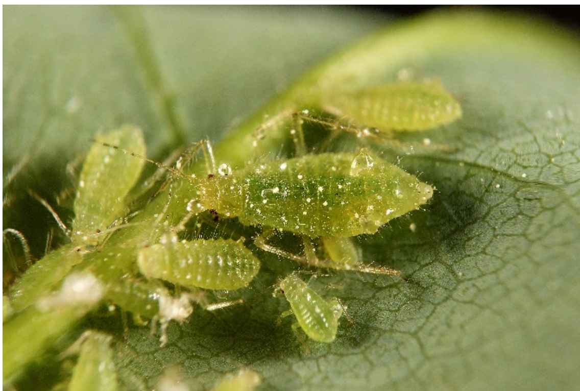
Fig. 2. Apterous viviparous female of Periphyllus acerihabitans on Acer buergerianum .