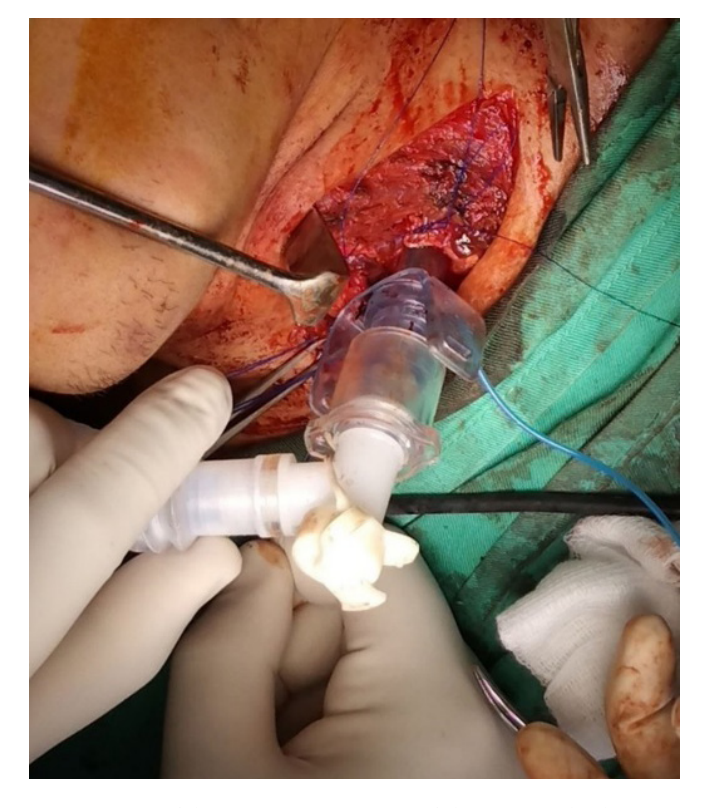
Fig. 4. Successful primary anastomosis of the cricotracheal airway with stay sutures in situ . Note the high tracheotomy done using the preexisting defect.

within 2 weeks to avoid vigorous movements of the neck. On day 14 postoperatively, a second-look procedure was done. Direct la-