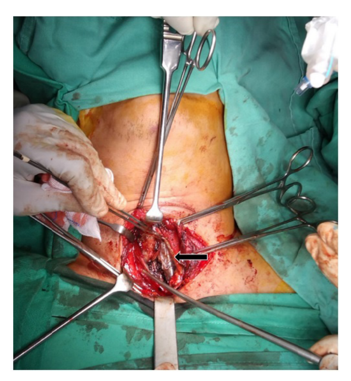
Fig. 2. Immediate exposure of the endotracheal tube (arrow) after incising the pretracheal fascia. The tracheal rings are not in view as they had avulsed inferiorly.

Postoperatively, the patient was kept on a nil-by-mouth regimen. Feeding was done via a nasogastric tube and a proton pump inhibitor was started. He was slowly weaned from sedation