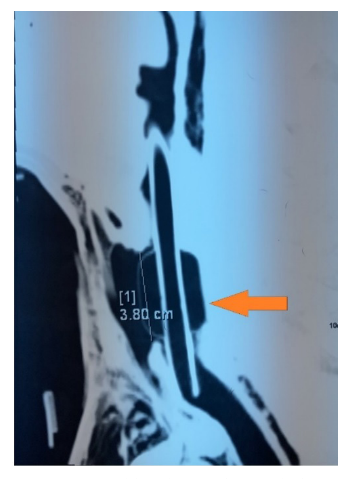
Fig. 1. Sagittal view of the neck computed tomography showing loss of the first to third tracheal rings with an endotracheal tube in situ (arrow). [1] indicates the length of the tracheal defect (3.80 cm) caused by separation.

Computed tomography of the neck showed massive subcutaneous emphysema, with the possibility of loss of the first to third tracheal rings and fracture of the lateral lamella of cricoid plate (Fig. 1). The patient was then referred to the otorhinolaryngology department for laryngeal trauma. He was started on intravenous dexamethasone (8 mg, three times daily) and was admitted