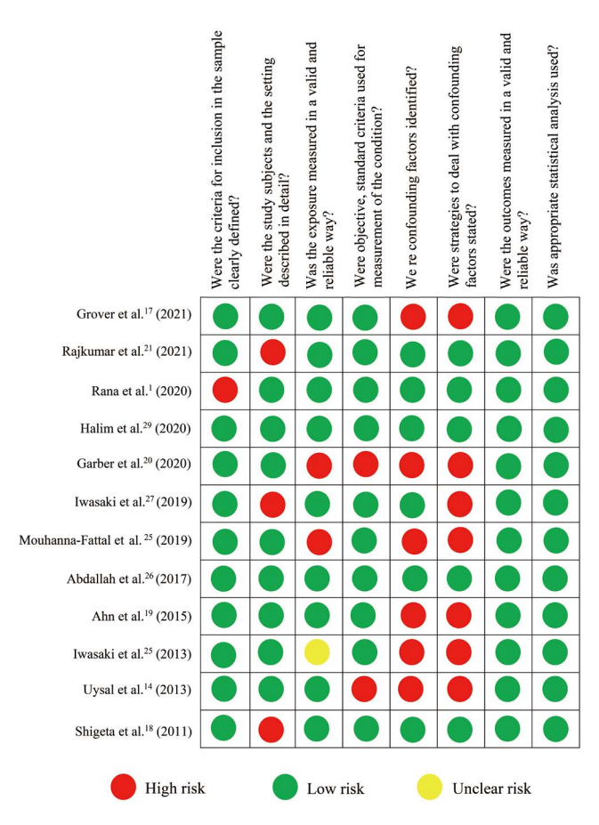
Fig. 1. Risk of bias assessment using the JBI critical appraisal checklist for analytical cross-sectional studies performed by 3 appraisers. JBI: Joanna Briggs Institute

The searches of the PubMed, Scopus, ScienceDirect, and SAGE Journals databases yielded a total of 25,780 articles; these were then screened for articles published in the last 10 years, resulting in 14,945 articles. The next selection involved removing 14,865 duplicate articles. Screening of titles and abstracts yielded 39 articles. All articles