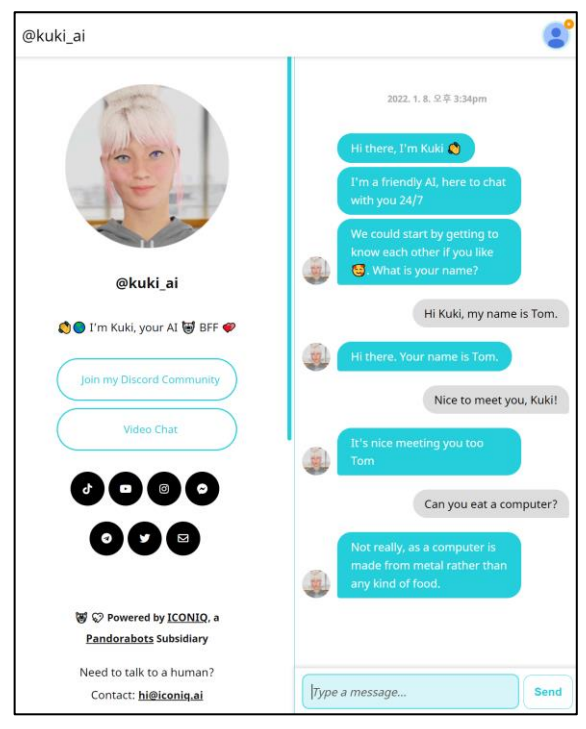
Figure 1. Kuki chatbot

users and shows adequate performance of given conversational tasks [17]. The current study used Kuki chatbot for the participants to experience the actual use of chatbot to survey their perception on the use of chatbot in the primary English education in Korea.