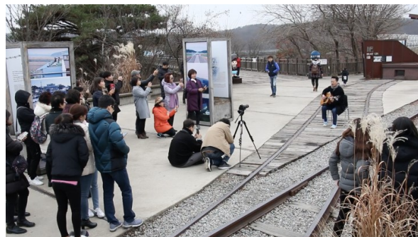
Figure 2. Guerrilla Mini Concert Shooting at Imjingak