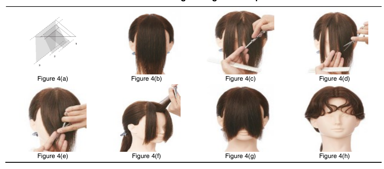
Table 4. Heart bang cutting and completion

As shown in Figure 4(a) draw a diagram before starting the cut. Figure 4(b) Divide the front zone. Figure 4(c) Create three triangles with respect to the center and then cut parallel to the section of the first triangle. Figure 4(d) Cut the second triangle into a diagonally parallel to the section. Figure 4(e) The third triangle also uses the same technique and cuts the other side equally. Figure 4(f) It is disconnected in layers from 1/2 the size of the entire triangle to create a texture. Figure 4(g) Completion are pictures showing the cutting process and Figure 4(h) is a styling image of the completed Heart bang.