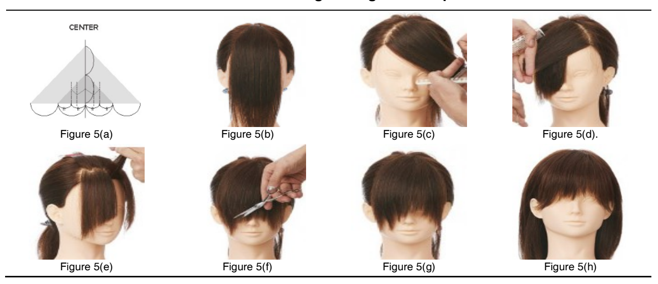
Table 5. Feather bang cutting and completion

As shown in Figure 6(a) draw a diagram before starting the cut. Figure 6(b) Divide the front zone. Figure 6(c) The under section is a square shape and sets the length of the guide from the center. Figure 6(d)The middle section is also conducted with the same technique. At this time, move the body position and cut it. Figure 6(e) Brush the top section in the direction of the morrow and cut it into squares. Figure 6(f) Balance the side with an ellipse about one finger thick. Figure 6(g) Completion are pictures showing the cutting process and Figure 6(h) is a styling image of the completed Blunt bang.