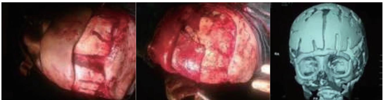
Fig. 3. 3D computed tomography showing effective reconstruction by craniotomy.

In terms of surgical procedures, five cases (27.8%) underwent endoscopic technique (ET), 10 cases (55.6%) underwent craniofacial reconstruction, and three cases (16.6%) underwent open burring of the metopic ridge. So the open technique (OT) was 13 patients (72.2%). Estimated blood loss was 55 mL in ET and 150 mL in OT. Operative time was 1.6 hours in ET and 2.8 hours in OT.