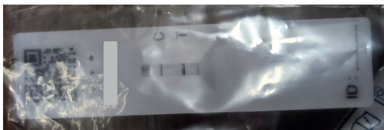
Fig. 1. Positive severe acute respiratory syndrome coronavirus-2 rapid antigen test from oropharyngeal swab.

Following diagnostics the patient was hospitalised in an isolation ward. Initially the following products were administered intravenously: Hartmann's solution (2.5 mL/kg/h), paracetamol (10 mg/kg q8h), dexamethasone (0.1 mg/kg q24h), clavulanate amoxicillin (20 mg/kg q8h), omeprazole (1 mg/kg q12h). Within 12 h of commencing this treatment the pyrexia had resolved (rectal temperature consistently in the range of 38.4–38.7°C). By 36 h post-admission the tachypnoea was persistent (44–60 breaths/min) but the dyspnoea had resolved. The patient was discharged from hospital approximately 48 h following admission. A graph showing the changes in respiratory rate and rectal temperature from the point of admission to the time of discharge is displayed in Fig. 3 . At the time of discharge the patient had been transitioned onto oral medications: paracetamol (12.5 mg/kg q8h for five days), fenbendazole (47 mg/kg q24h for five days), clavulanate amoxicillin (18.75 mg/kg q8h for three weeks), omeprazole (1 mg/kg q12h for three days).