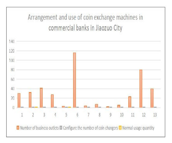
Fig. 1. Configuration of coin exchange machines in commercial banks in Jiaozuo City