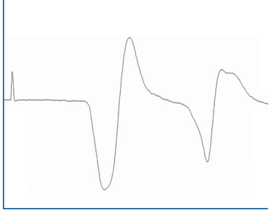
Fig. 1. Electromyography of (A) control group, (B) surgery+saline group, and (C) surgery+gallic acid group.