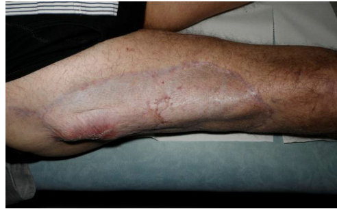
Fig. 1. Firm swelling at the proximal anterolateral thigh donor site.

Over the course of 9 months following radiotherapy, the patient slowly developed a painless swelling on his right thigh. On examination, he presented a hard, raised mass measuring 12 × 5 cm under the healed split-thickness skin graft on the ALT donor site (Fig. 1). The mass did not affect his mobility. Plain X-ray films (Fig. 2A) and a computed tomography scan (Fig. 2B) were obtained and evaluated by senior radiologists with experience in