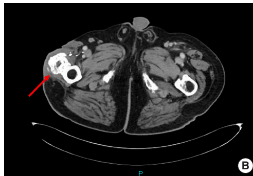
Fig. 2. Heterotopic ossification (red arrow) at the right thigh anterolateral thigh donor site. (A) Plain X-ray film. (B) Computed tomography scan.

sarcoma surgery, who agreed that the findings were consistent with heterotopic ossification and that histological confirmation was not required. The patient was reassured, and no further surgical intervention was sought.