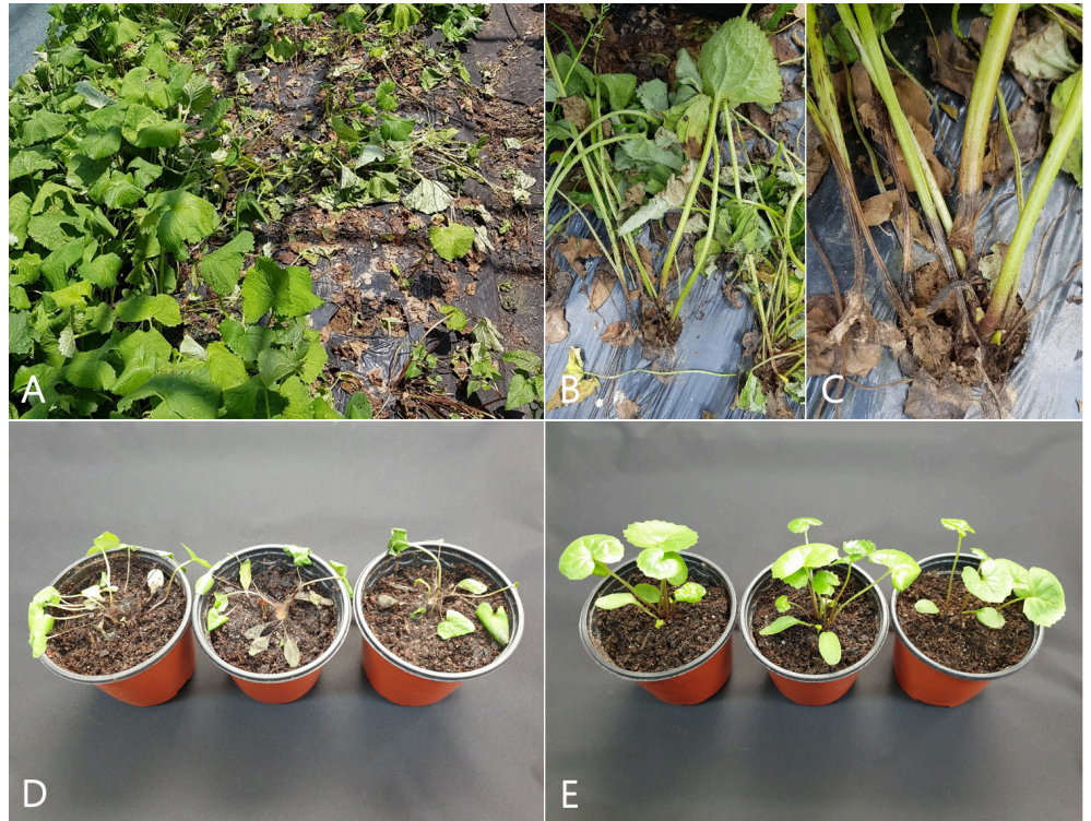
Fig. 1. Damping-off symptoms of Fischer's ragwort plants. A-C: Symptoms observed in the vinyl greenhouse investigated. D: Symptoms induced by artificial inoculation tests with Rhizoctonia solani AG-2-2 (IIIIB) isolates. E: Non-inoculated plants (control).

The isolates were tested for anastomosis grouping using tester isolates of R. solani , as previously described [1]. The tester isolates of R. solani (AG-1 through AG-5) used were identical to those used in a previous study [4]. All the tested isolates were classified as R. solani AG-2-2. Anastomosis reactions between the tested isolate and the tester isolate of R. solani AG-2-2 are shown in Fig. 2A. Mycelia of the isolates cultured on PDA were brown to dark brown in color, and the colony displayed concentric zones (Fig. 2B). Sclerotia, which are dark brown, woolly, and spherical to irregular in shape, were absent or rarely formed on the medium. The cultural type of the isolates was identified as IIIIB of R. solani AG-2-2, based on the cultural characteristics described in a previous study [5].