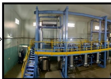
Fig.2 CO 2 Extractor Machine