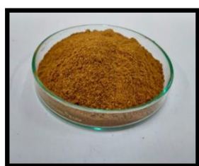
Fig.1 Core Powder of T. chebula

First of all CO 2 which was stored in tank is pumped to the extractor (Fig. 2) where pressure was maintained at 300 bar (=296.077atm) and at the temperature 304 K (31°C). In the extractor, liquid CO 2 and feed (Fig. 1) come in contact with each other and extraction of essential component from feed was carried out. The product steam which contains CO 2 and essential component goes to the cyclone separator through PRV (Pressure relieving valve), due to deduction in pressure PRV liquid CO 2 is converted into gas. In cyclone separator CO 2 gas and essential component (liquid form) are separated from each other. From the top of the cyclone separator CO 2 is recycled back to the tank, before sending it to the tank, CO 2 which turned to gaseous state is condensed with the help of condenser. From the bottom of the cyclone separator essential components i.e. CO 2 extract of T. chebula (Fig. 3) was obtained.