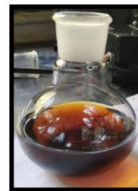
Fig.3 CO 2 extract of T. chebula