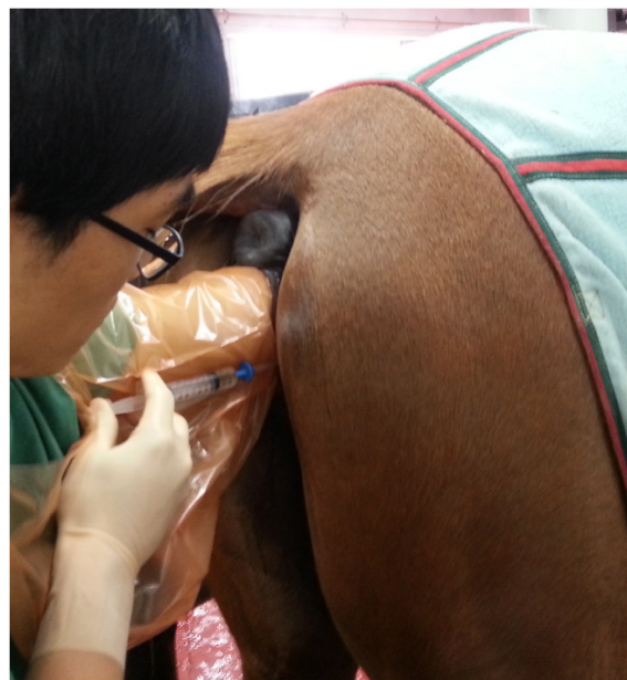
Fig. 4. Insemination catheter was used to administer 1 mL of peanut oil into the uterus of the Thoroughbred mare.

was applied to the sterilized rectal sleeve (KRUTEX Super Sensitive Gloves with Shoulder Protector, KRUUSE, Langeskov, Denmark), and the marble was inserted into the uterus via the vagina to the cervix and placed in the uterine body. To prevent uterine sepsis, a prophylactic antimicrobial, penicillin G procaine (20,000 IU/kg, IM, PPS ® , Daesung Microbiological Labs, Euiwang, Korea), was administered after treatment.