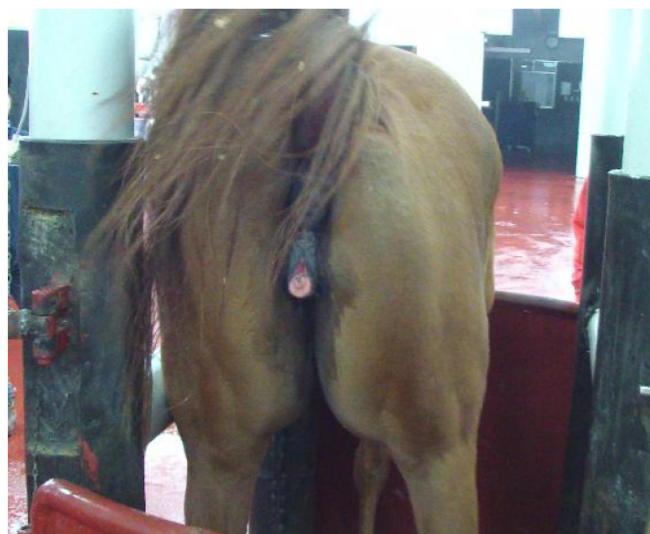
Fig. 1. Tail lifting with clitoral winking in the Thoroughbred mare.

On the ovulation day, an autoclaved 35-mm glass marble (Mare-bles, Glass Bay studio, OR, USA) was inserted into the uterus (Fig. 3). The perineal region was prepared using a 1% chlorhexidine solution. A small amount of 0.5% chlorhexidine cream (Arlico chlorhexidine cream, Arlico, Jincheon, Korea)