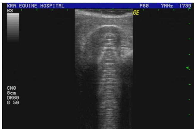
Fig. 3. The ultrasound appearance of intrauterine glass ball at the right uterine horn-body junction.

was applied to the sterilized rectal sleeve (KRUTEX Super Sensitive Gloves with Shoulder Protector, KRUUSE, Langeskov, Denmark), and the marble was inserted into the uterus via the vagina to the cervix and placed in the uterine body. To prevent uterine sepsis, a prophylactic antimicrobial, penicillin G procaine (20,000 IU/kg, IM, PPS ® , Daesung Microbiological Labs, Euiwang, Korea), was administered after treatment.