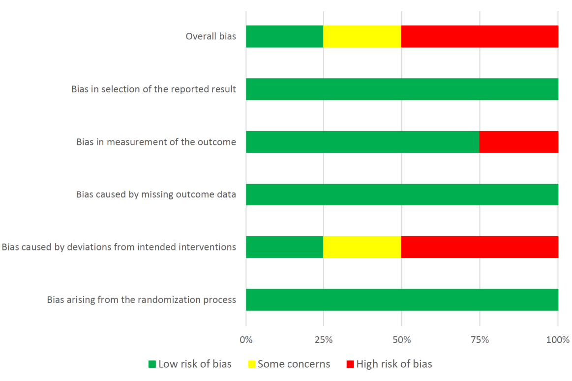
Fig. 3. Risk of bias in included studies.

IANB techniques (Study 4). The total number of randomized subjects was 452. Three studies included both male and female patients, and one study did not specify the sexes. The age range of the three included studies (Studies 1 and 2) was 18 to 50 years; whereas, in study 3, the upper limit of age was not mentioned, and in study 4, the average age of the participants was 30 years. All