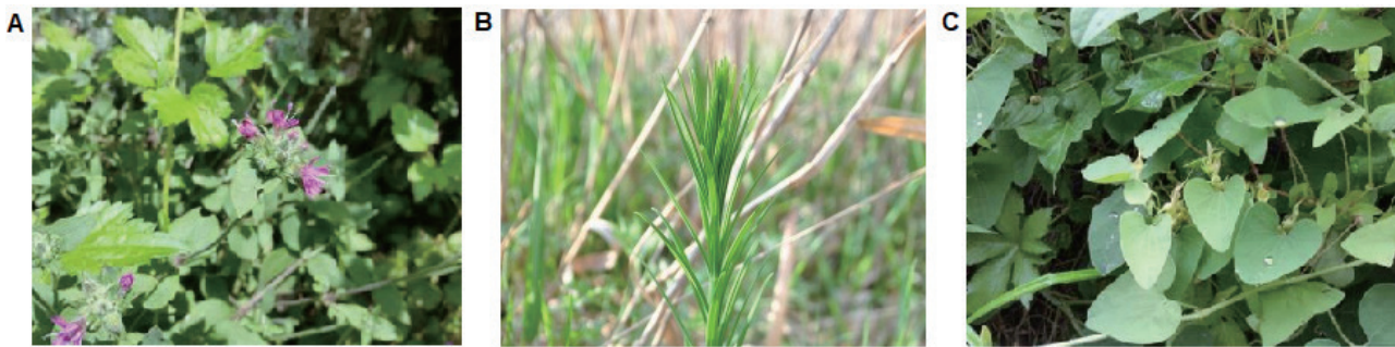
Fig. 2. Rare plants in Yongyangbo Wetlands. A. Silene capitata Kom., endangered species Class II; B. Polygonatum stenophyllum Maxim., endangered species; C. Aristolochia contorta Bunge, least concern.