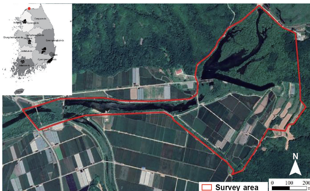
Fig. 1. Map of the survey area in Yongyangbo Wetlands.

A field survey of five sessions was conducted between April and August 2019 in accordance with the National Wetland Survey Protocol (ME, 2011). The survey was conducted on foot, covering the entire Yongyangbo Wetlands. Identification and classification were performed as described by Lee (1996a), Lee (1999), and Park (2009). Scientific and Korean names were assigned in accordance with the National List of Species of Korea (National Institute of Biological Resources (NIBR), 2020). Plant lists