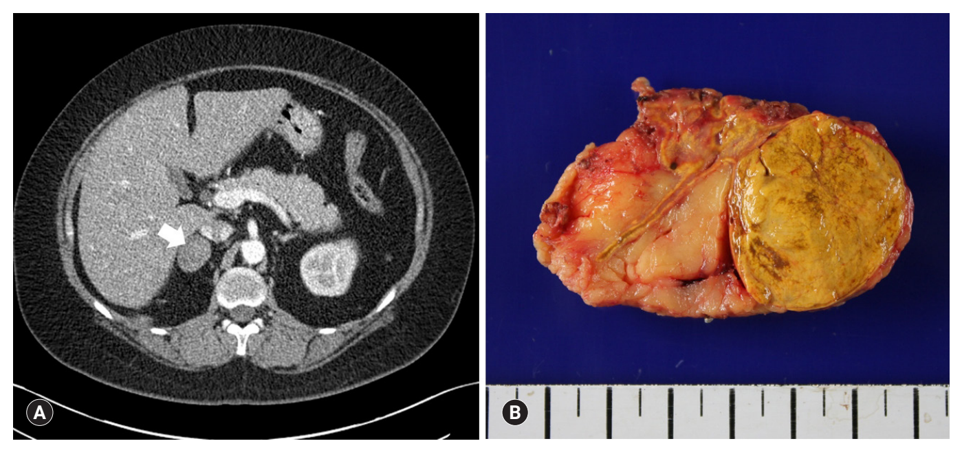
Fig. 1. (A) Abdominal computed tomography reveals a 35×28 mm, hypoattenuating mass (arrow) in the right adrenal gland. (B) The excised right adrenal gland shows a well circumscribed, yellowish mass.